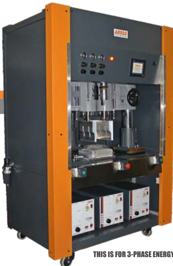
THIS IS FOR 3-PHASE ENERGY METER